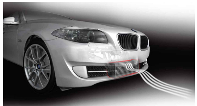
M Performance Power Kit charge air cooler

Before ordering, always check the specified part numbers in the EPC. Only the EPC provides the information that should be taken as valid and current.