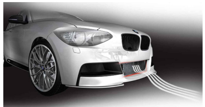
M Performance Power Kit charge air cooler

* Based on the example of the F22 automatic.